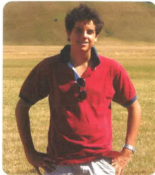
Blessed Carlo Acutis (1991–2006) served the needy and built an internet gateway for exploring eucharistic miracles.